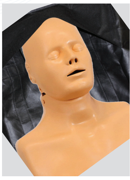
Additional protection with headboard