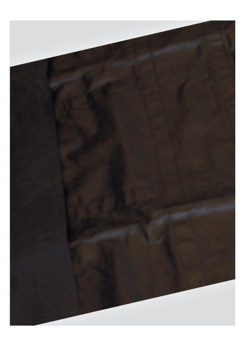
double PVC-coated polyester tarpaulin material